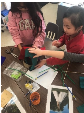
WISE KidNetic Energy

Language Arts: Let's build our love of reading! We are going to explore books together to become a stronger reading community.